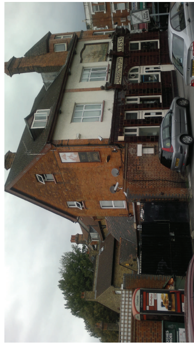
photo of adjacent Nelson Arms pub